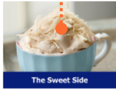
The Sweet Side