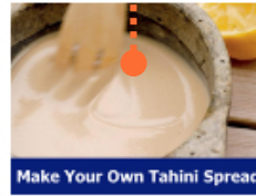
Make Your Own Tahini Spread