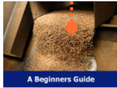
A Beginners Guide